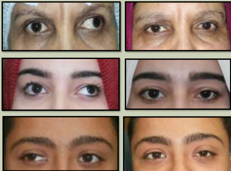
M R Resection